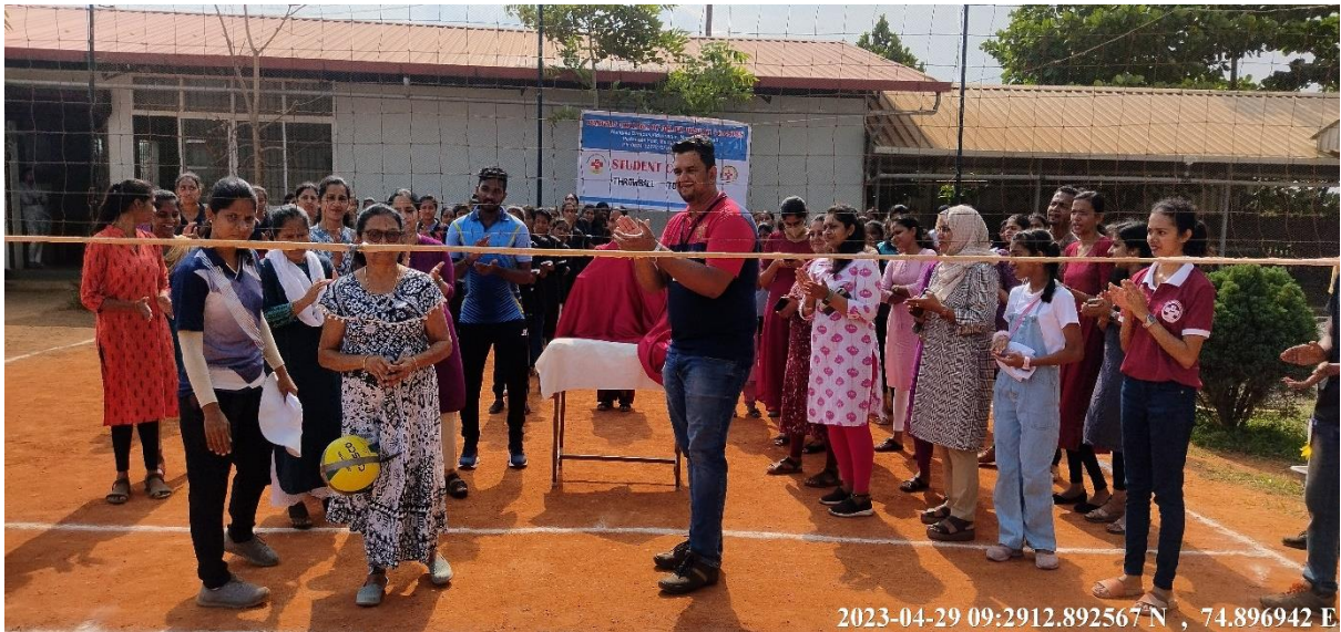
2023-04-29 09:2912.892567 N , 74.896942 E