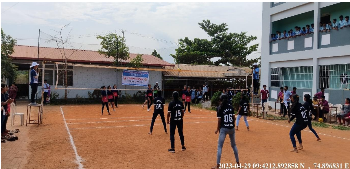
2023-04-29 09:4212.892858 N , 74.896831 E