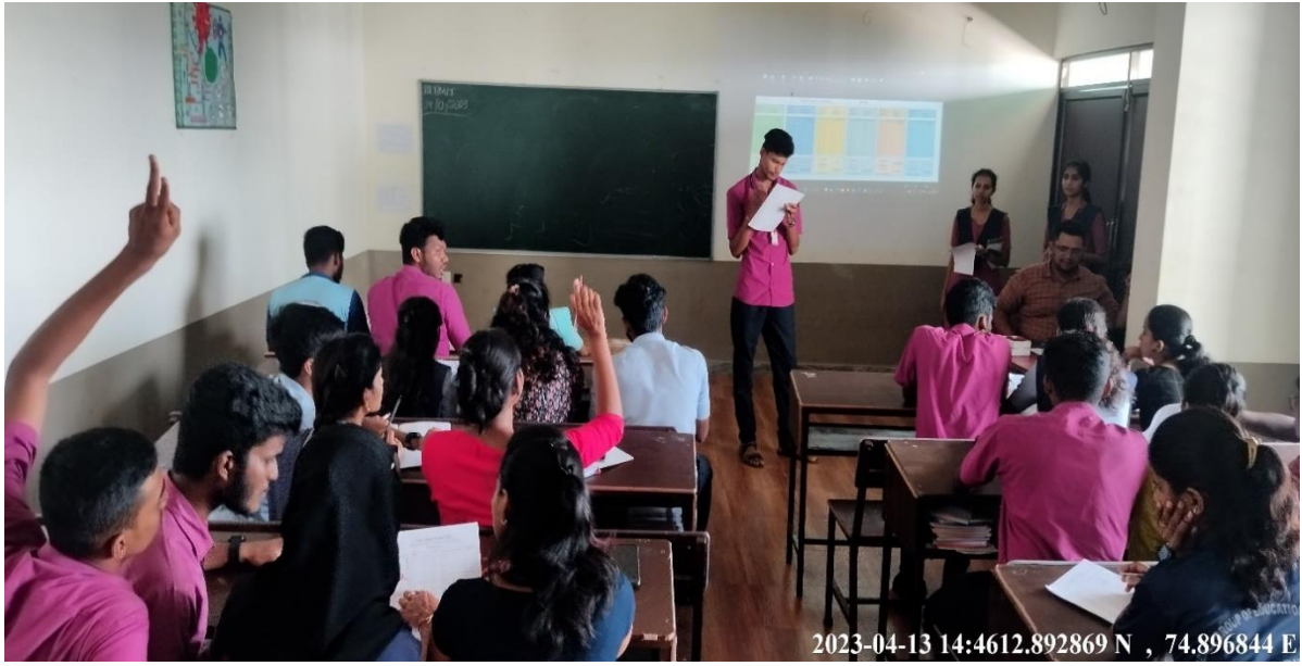
2023-04-13 14:4612.892869 N , 74.896844 E