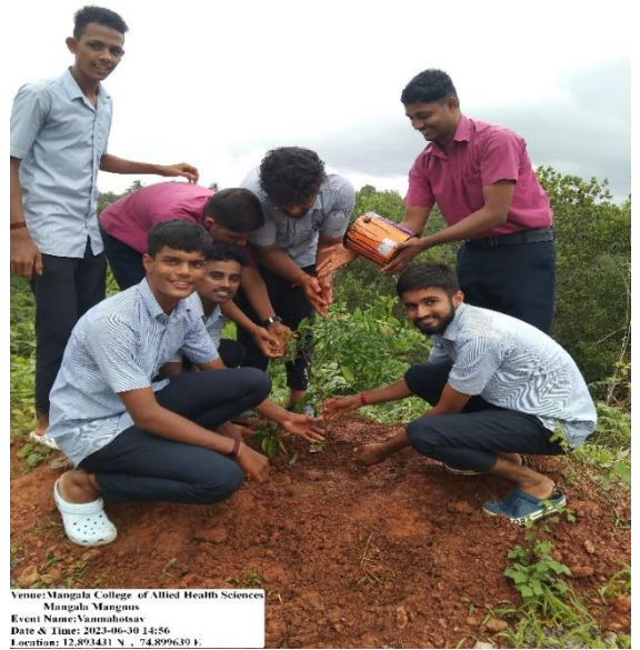
Venue: Mangala College of Allied Health Sciences Mangala Mangus Event Name: Vammahotsav Date & Time: 2023-06-30 14:56 Location: 12.893431 N , 74.899639 E