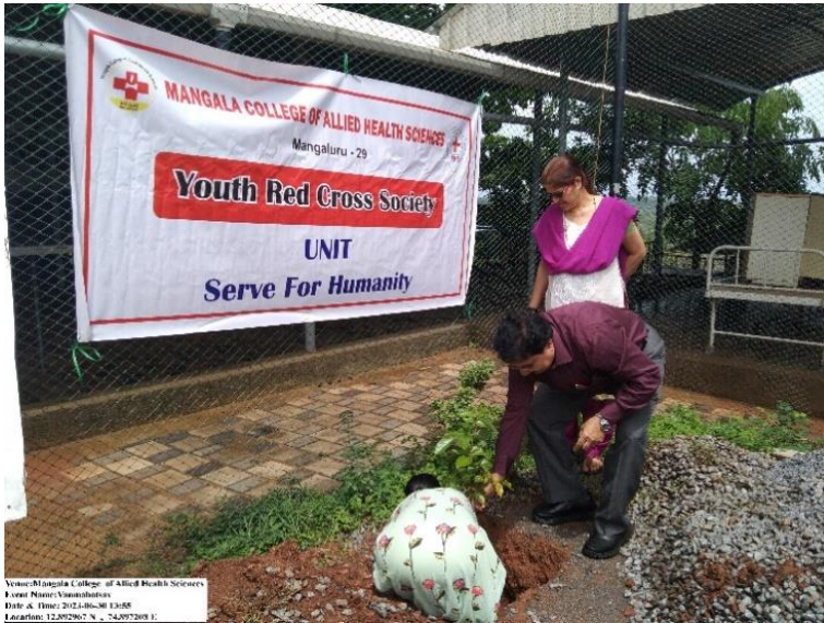
Venue: Mangala College of Allied Health Sciences Mangala Mangus Event Name: Vammahotsav Date & Time: 2023-06-30 14:56 Location: 12.892967 N , 74.897289 E