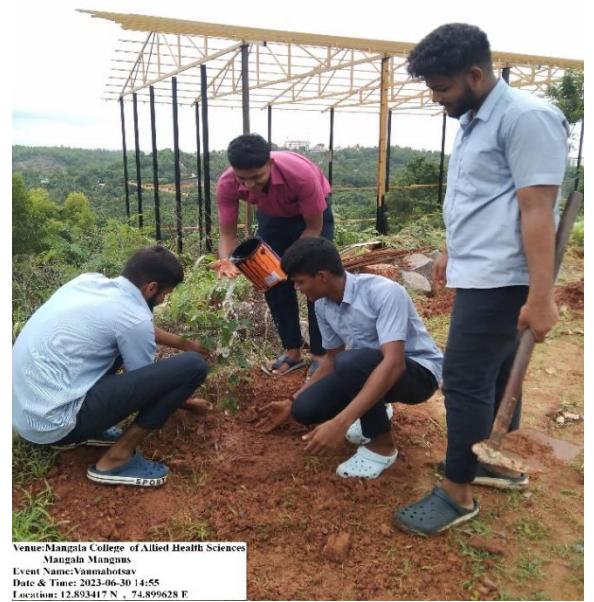
Venue: Mangala College of Allied Health Sciences Mangala Mangus Event Name: Vammahotsav Date & Time: 2023-06-30 14:55 Location: 12.893417 N , 74.899628 E