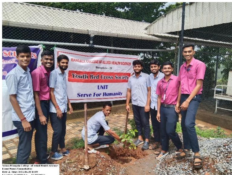
Venue: Mangala College of Allied Health Sciences Event Name: Vanmahotsav Date & Time: 2023-06-30 15:00 Latitude: 12.292967 N, - 74.901197 E

Students and all faculty members graced the occasion.