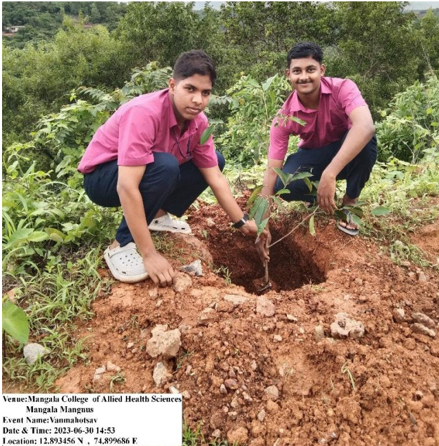
Venue: Mangala College of Allied Health Sciences Mangala Mangus Event Name: Vammahotsav Date & Time: 2023-06-30 14:53 Location: 12.893456 N , 74.899686 E