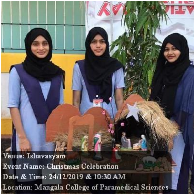
Venue: Ishavasyam Event Name: Christmas Celebration Date & Time: 24/12/2019 & 10:30 AM Location: Mangala College of Paramedical Sciences