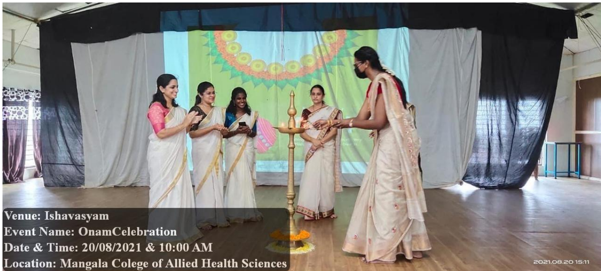
Venue: Ishavasyam Event Name: OnamCelebration Date & Time: 20/08/2021 & 10:00 AM Location: Mangala Colege of Allied Health Sciences

Pookalam Competition was organized and prizes were distributed among the winners. At the end the traditional Onam Sadya was served to the gathering.