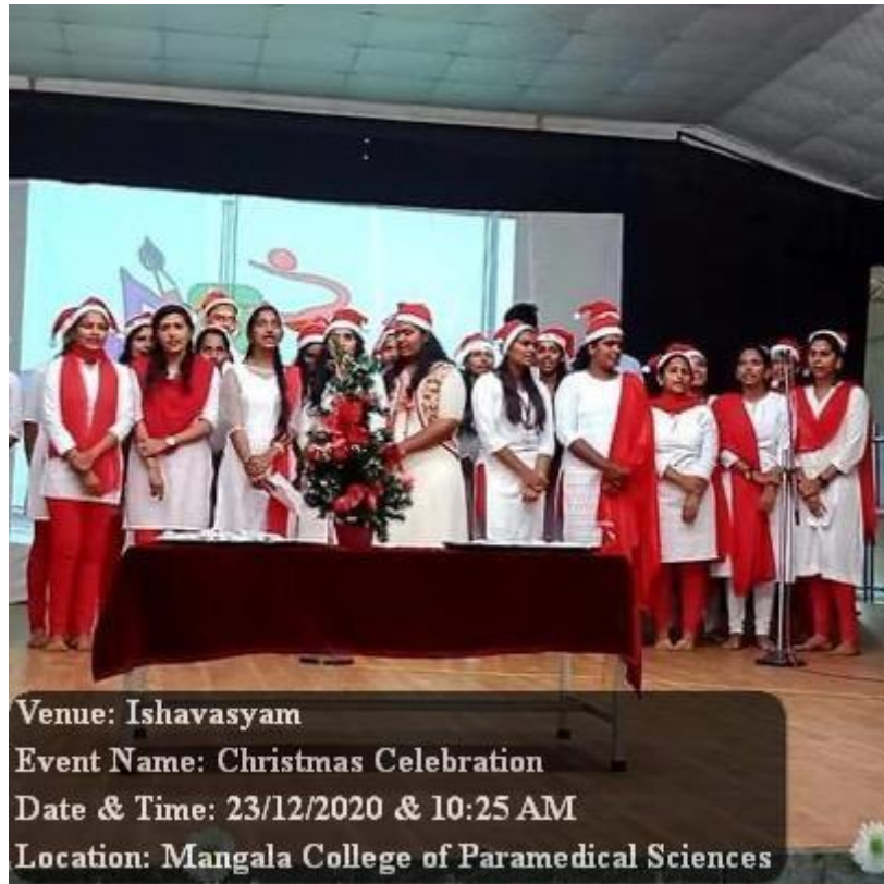
Venue: Ishavasyam Event Name: Christmas Celebration Date & Time: 23/12/2020 & 10:25 AM Location: Mangala College of Paramedical Sciences