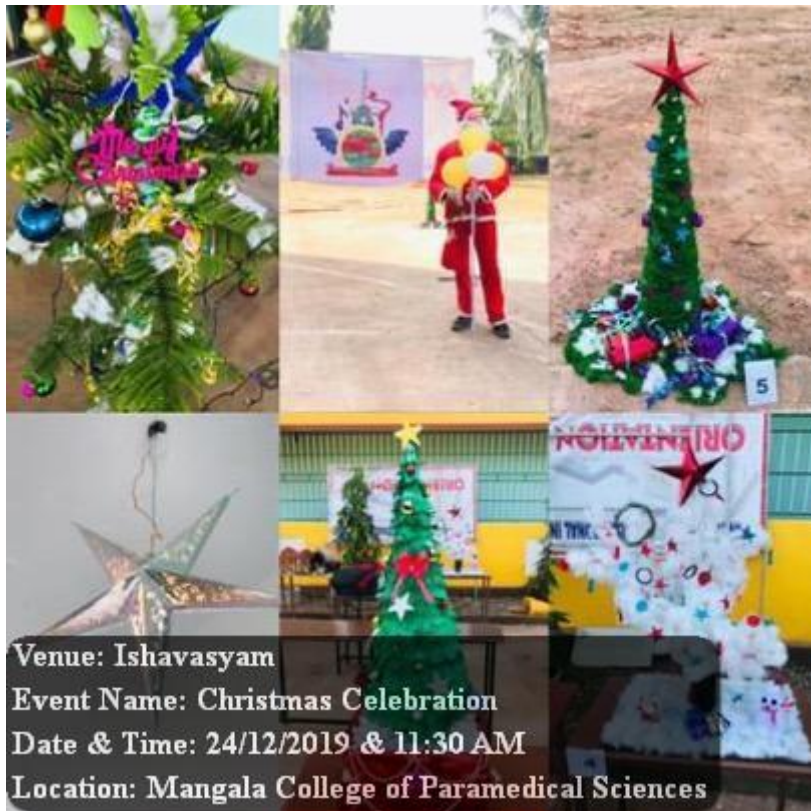
Venue: Ishavasyam Event Name: Christmas Celebration Date & Time: 24/12/2019 & 11:30 AM Location: Mangala College of Paramedical Sciences