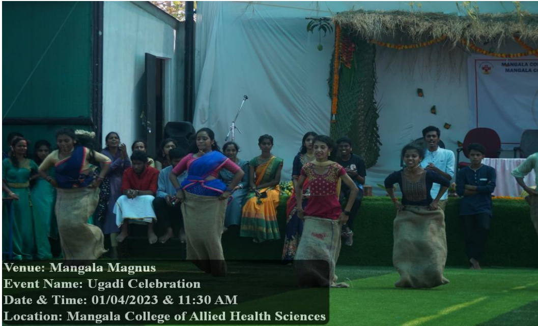
Venue: Mangala Magnus Event Name: Ugadi Celebration Date & Time: 01/04/2023 & 11:30 AM Location: Mangala College of Allied Health Sciences