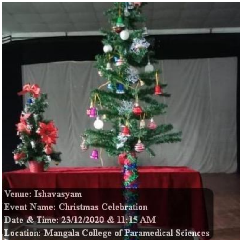
Venue: Ishavasyam Event Name: Christmas Celebration Date & Time: 23/12/2020 & 11:15 AM Location: Mangala College of Paramedical Sciences