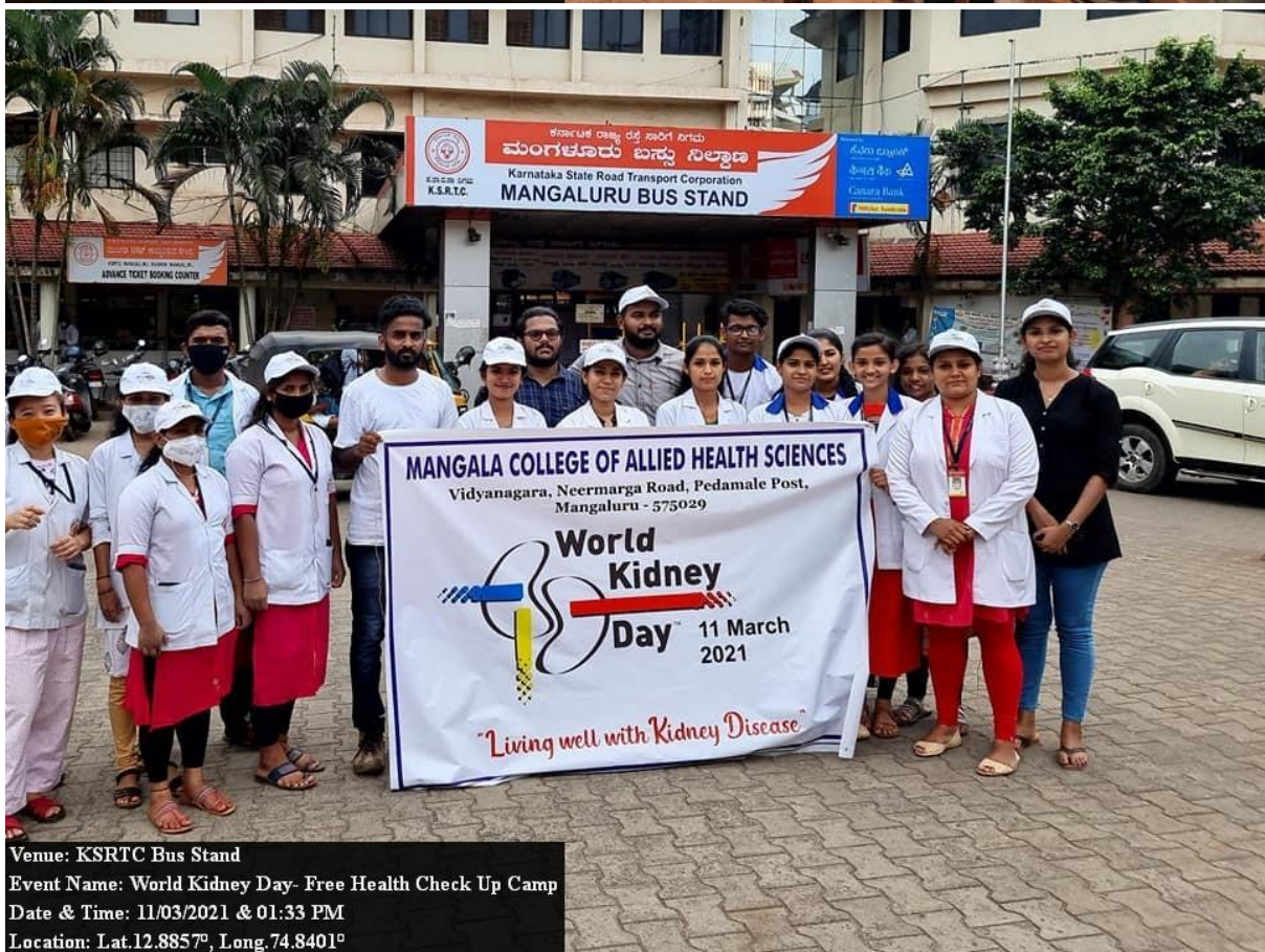
Venue: KSRTC Bus Stand Event Name: World Kidney Day- Free Health Check Up Camp Date & Time: 11/03/2021 & 01:33 PM Location: Lat.12.8857°, Long.74.8401°