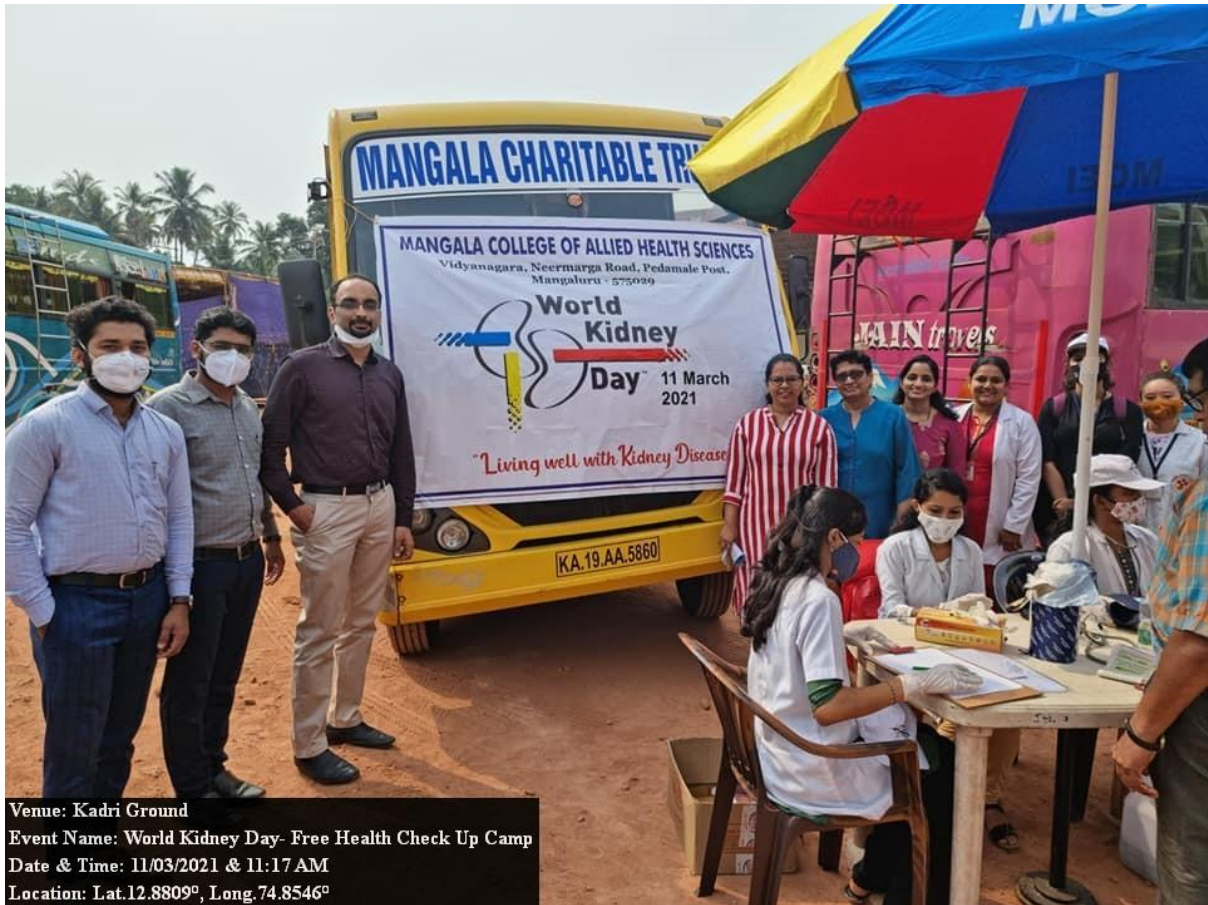
Venue: Kadri Ground Event Name: World Kidney Day- Free Health Check Up Camp Date & Time: 11/03/2021 & 11:17 AM Location: Lat.12.8809°, Long.74.8546°