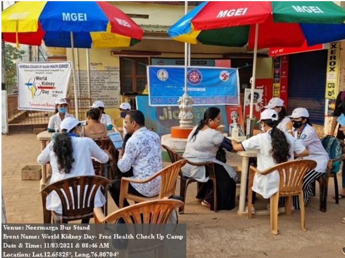
Venue: Neermarga Bus Stand Event Name: World Kidney Day- Free Health Check Up Camp Date & Time: 11/03/2021 & 08:46 AM Location: Lat.12.65825°, Long.76.00704°