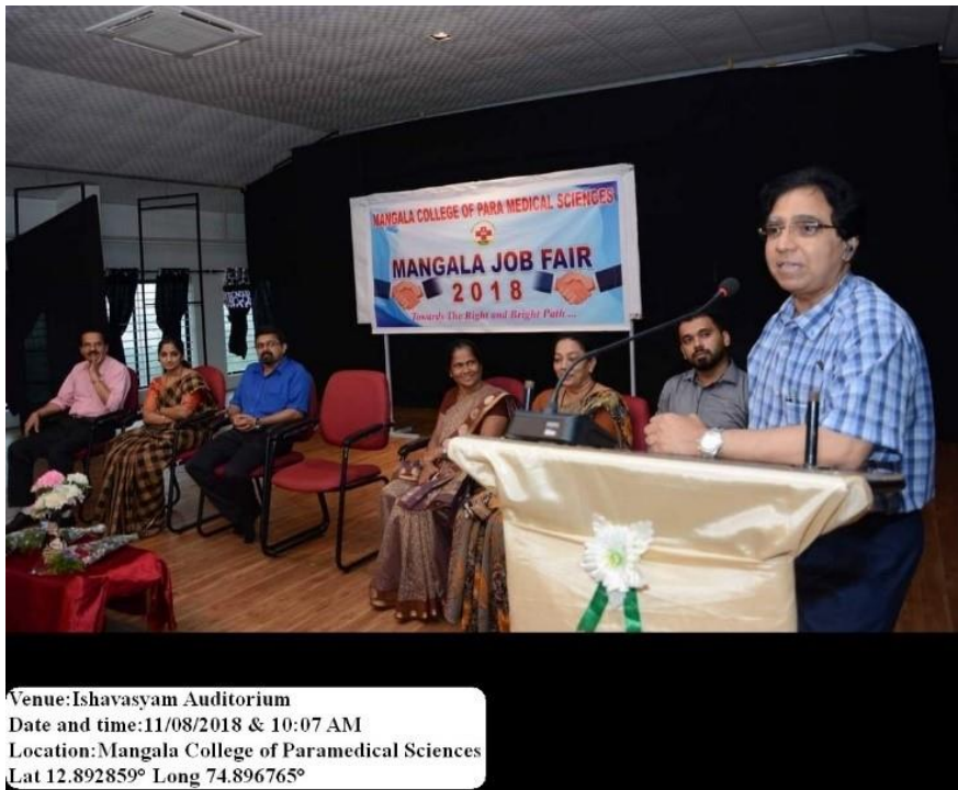
Venue: Ishavasyam Auditorium Date and time: 11/08/2018 & 10:07 AM Location: Mangala College of Paramedical Sciences Lat 12.892859° Long 74.896765°

The event attracted a significant number of job seekers from various institutions including the students of our own institution. Attendees consisted of current students, recent graduates and experienced professionals.